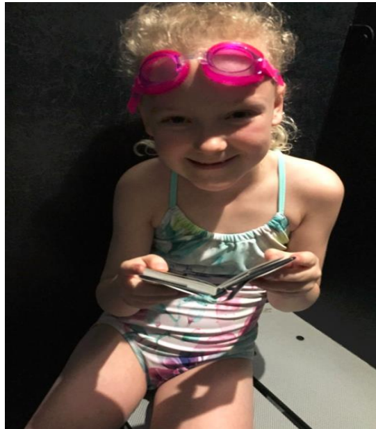
Read in an unusual place.