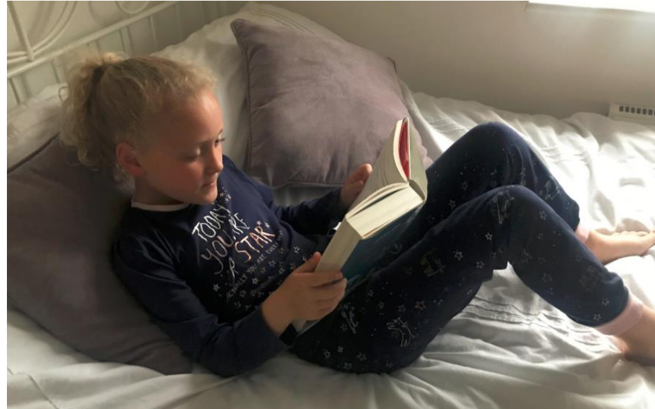
Read a non-fiction book.