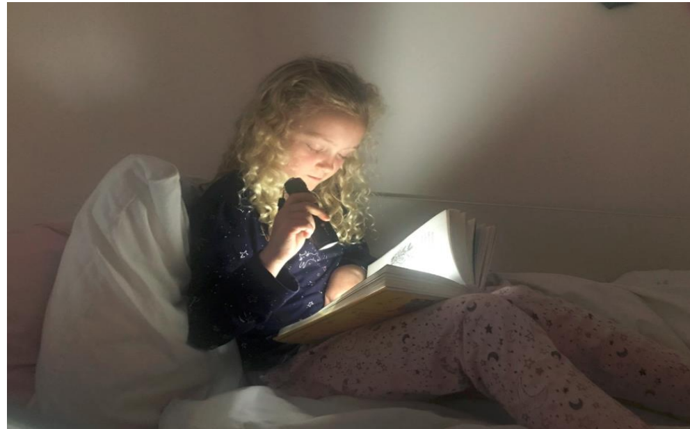
Read in the dark with a torch .