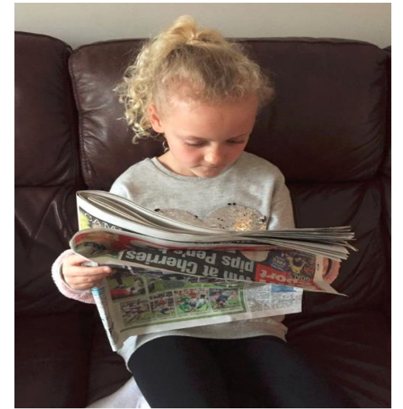
Read a newspaper.