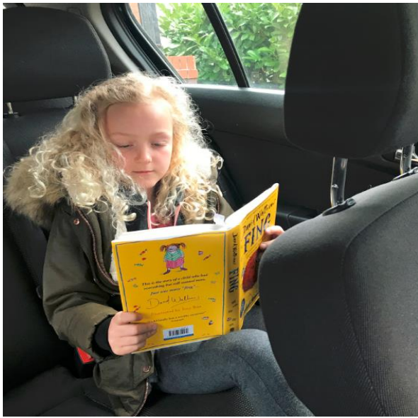
Read on a form of transport.