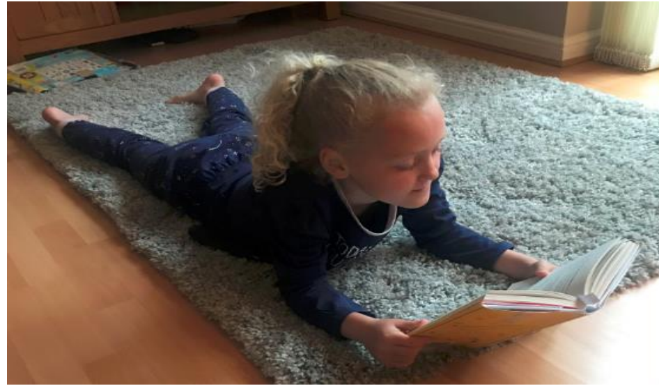
Read an adventure story.