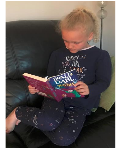
Read a book by Roald Dahl.