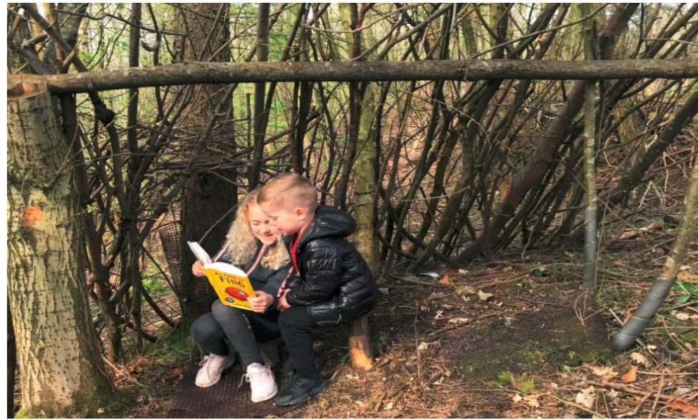
Read to a younger child in a handmade den.